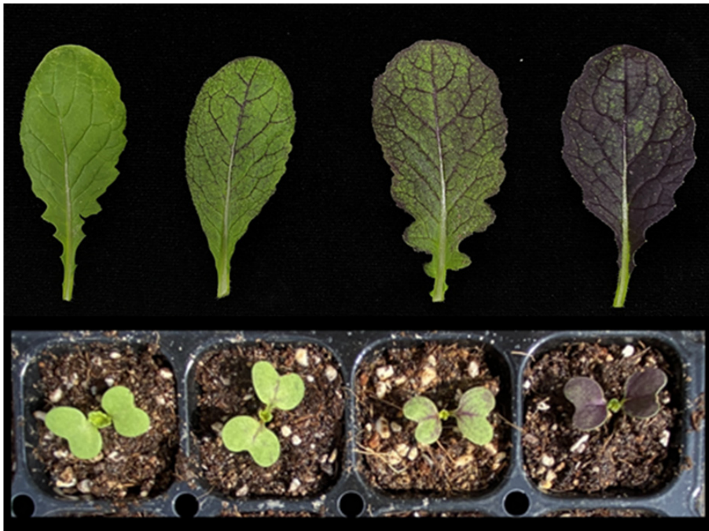
Supplementary Fig. 2. The purple phenotype variation of DH lines was classified based on the following differences: those with entirely green leaves without any purple were labeled as '1', those showing slight purple along the leaf veins as '2', those exhibiting purple not only along the veins but also at the leaf margins were classified as '3', and petiole showing green but appearing dark purple overall were categorized as '4'.