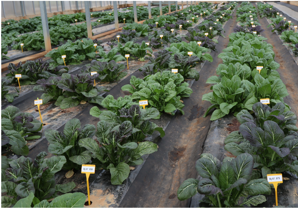
Supplementary Fig. 1. 117 DH lines in the field for ten weeks after germination.